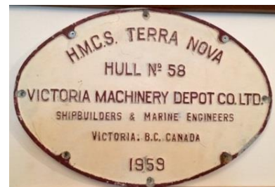
Hull number plaque Naval Museum of Halifax

During a keel-laying a ship may be referred to by her project number (in Protecteur's case, JSS1) or builder's hull number in preference to her name, as the ceremony at which a ship is named occurs later with the launching of the ship. 10 And it has not been unknown for a ship's name to be changed whilst she is still under construction. The shipbuilder's number for a ship is the sequential number of hulls built by that company. What will become HMCS Protecteur is Seaspan hull number 194. Typically, a plaque with the builder's name and number is affixed to the back bulkhead of the ship's bridge.