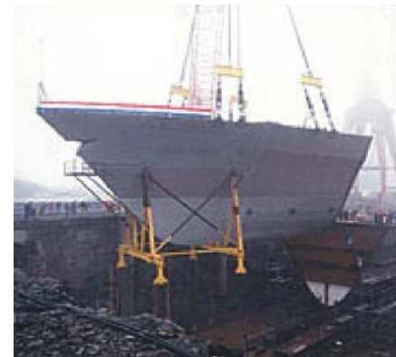
Lowering of bow block, future HMCS Montréal

The keel of a ship is the "primary fore-and-aft part of a ship's frame. It runs along the bottom connecting the stem and the stern." 4 In a wooden or older steel ship, the keel extends the whole length of the vessel. Attached to it are the stem (the foremost steel part forming the bow), sternpost (the upright structural member at the stern) and the ribs of the vessel. This definition reflects how ships were customarily built. Nowadays a ship may be built of blocks, fabricated separately with fittings and equipment inside, then brought together to form the hull and superstructure of the ship. In the case of the support ships, each is built of 13 'rings' composed of 39 'grand blocks' made up from a total of 123 smaller blocks. It can be the lowering of part or whole of a grand block onto a cradle on the building ways 5 that is the 'keel-laying' for a modern naval vessel. 6