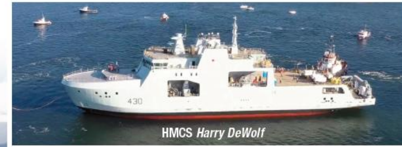
HMCS Harry DeWolf